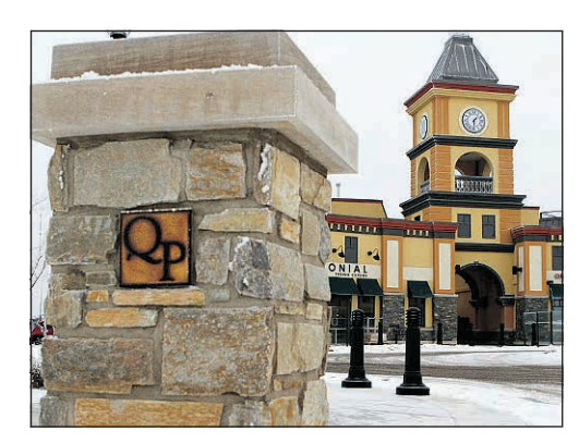
The retail and shopping area of Quarry Market in Quarry Park as seen in 2009.

The multi-faceted company is also involved in things like site assessment and evaluation, interior design and space planning, and property management.