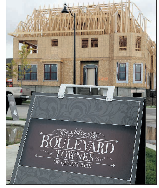
Below, the sales centre for the project.

PROJECT: The Boulevard Townes of Quarry Park. BUILDER: Birchwood Properties. DEVELOPER: Remington Development Group. POSSESSION DATE: December.