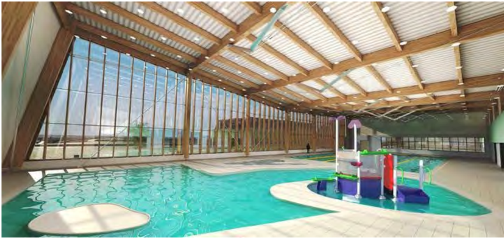
Artist's rendering shows the pool at the proposed Quarry Park rec centre.

FIRST POSTED: MONDAY, JUNE 17, 2013 01:06 PM MDT | UPDATED: MONDAY, JUNE 17, 2013 01:45 PM MDT